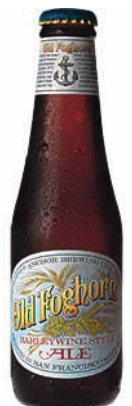
7 oz bottle

http://www.anchorbrewing.com/beers/oldfoghorn.htm